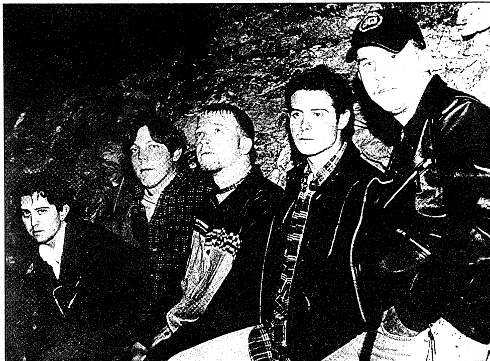
Lexington's own Funnel will open Cincinnati's weekend spring extravaganza, Jammin' On Main . The gig will be the band's biggest show yet. The group has been together for only 16 months.