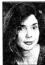
Nanci Griffith will perform at 10:30 tonight as part of Jammin' on Main .

Other Jammin' on Main highlights include Texas country-folk queen Nanci Griffith (10:30 tonight), a pairing of Lone Star pop-rockers Fastball with the busiest rock 'n' roll combo this spring, the Goo Goo Dolls (8:50 p.m. Saturday) and '70s pop icon Peter Frampton (10:30 p.m. Saturday). Tickets are available through TicketMaster (281-6644) or at the gate.